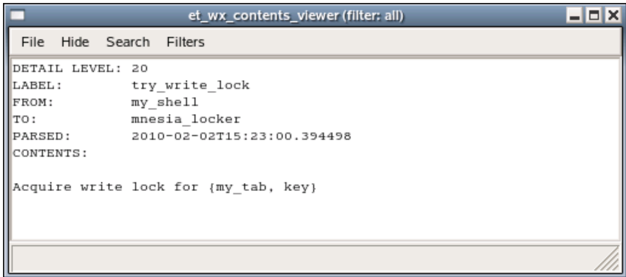
Figure 3.3: Details of a write lock message